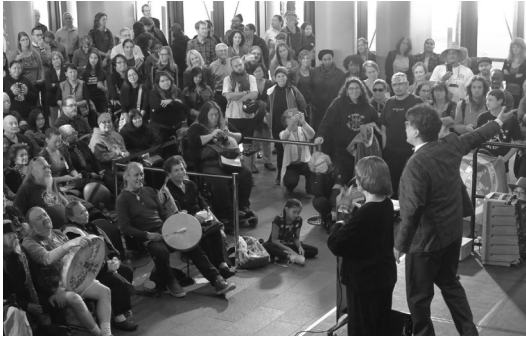
Indigenous People's Day with Sherman Alexie

The annual RSJI Speaker Series brings powerful and provocative speakers from across the country to speak on racial equity. In 2016, RSJI welcomed two extraordinary figures to speak at events that were open to the community: