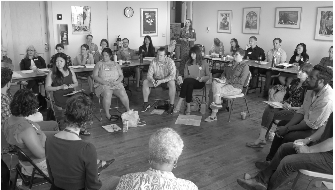
Turning Commitment to Action Cohort